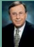
André Boulerice Minister delegate Immigration Quebec

The opportunities for fun and entertainment are plentiful here. From the sedate and fascinating Botanical Gardens to the bright lights and glitter of the Casino de Montréal, there is something to soothe or perhaps excite the spirit. From the Cosmodome Space Camp for would-be astronauts to La Ronde for ordinary thrill seekers, Montreal educates as easily as it entertains. And from the Old Port to Saint Joseph's Oratory, the history of Montreal is evident on every corner - the great cities of the world never forget their roots. Find a quiet spot in this island city and listen carefully. Under all the hum and verve of a modern metropolis at work, you sometimes hear the splash of the Voyageurs' paddles bringing their stacks of beaver pelts for trade. And the peal of church bells in the distance is a constant reminder that Mark Twain was so right about Montreal.